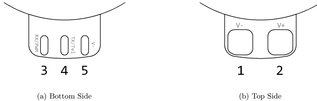
Figure 1: Connector Board